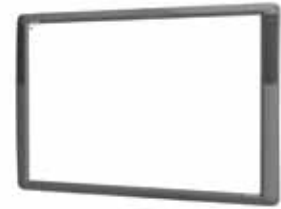
ActivBoard 500 Pro